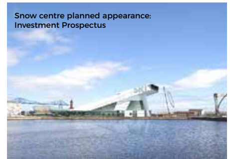
Snow centre planned appearance: Investment Prospectus

A finance workshop, delivered by Clive Owen LLP helped businesses understand finance and funding opportunities and explored the different options for business owners to grow, maintain and secure their businesses.