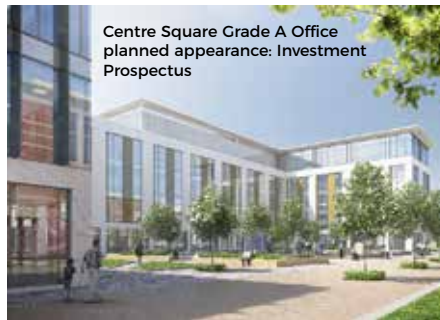
Centre Square Grade A Office planned appearance: Investment Prospectus