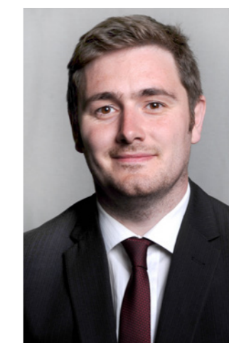
Chris Cooke, Elected Mayor of Middlesbrough